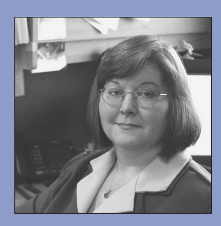
Natural Quality Service