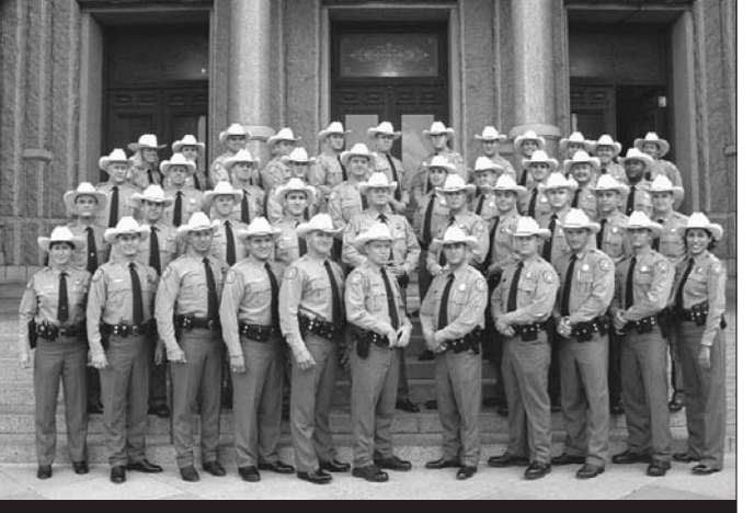
50th Game Warden Cadet Class

Other notable law enforcement accomplishments in FY04 included: